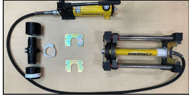
Figure 2. 1 1/4" and 2" Lycofit Installation Tool